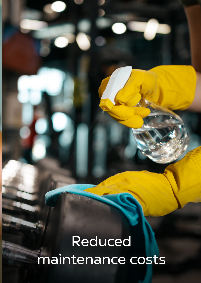
Reduced maintenance costs