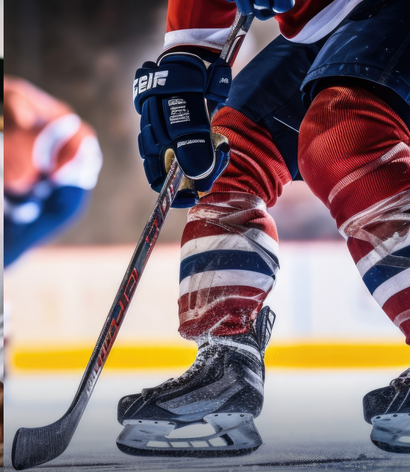
Decades of sports facility climate control expertise