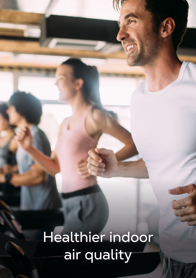
Healthier indoor air quality