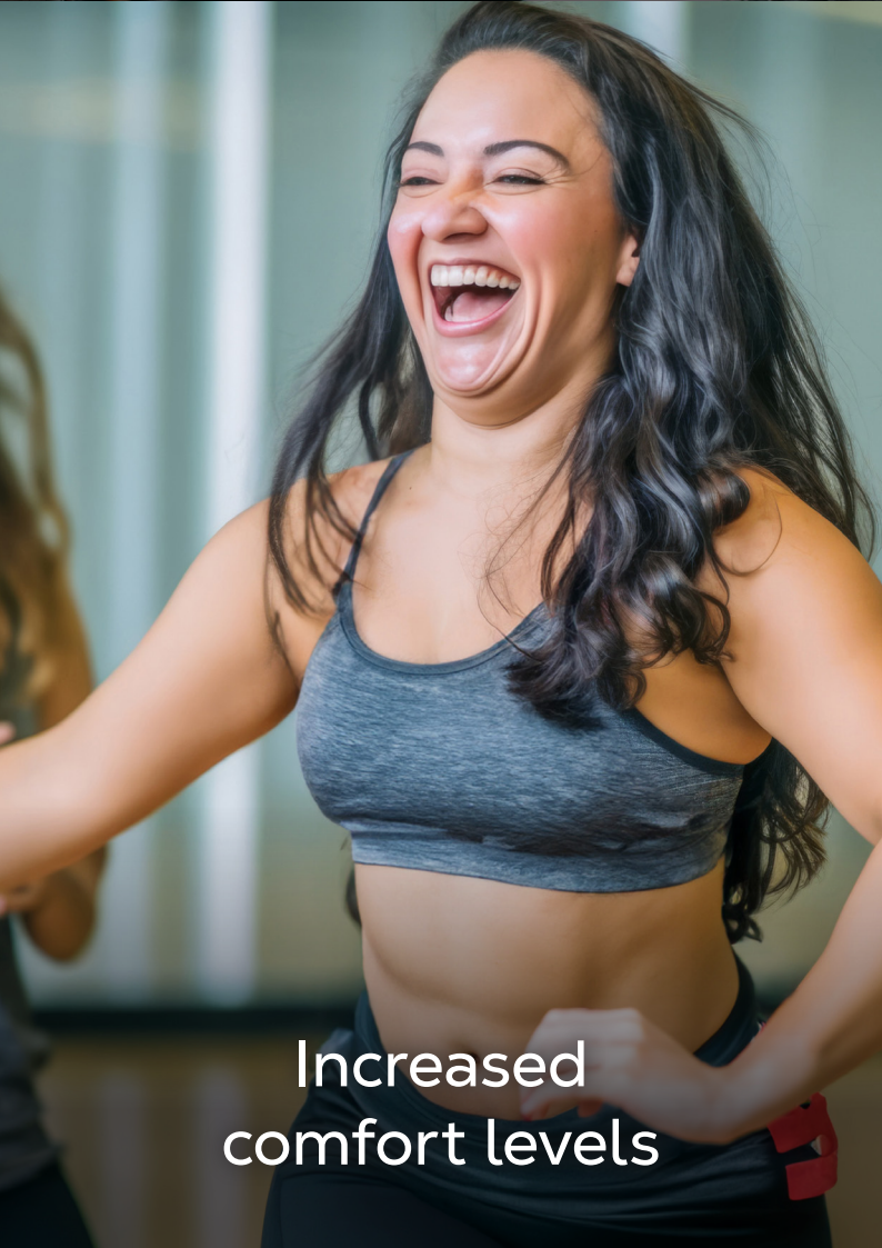
Increased comfort levels