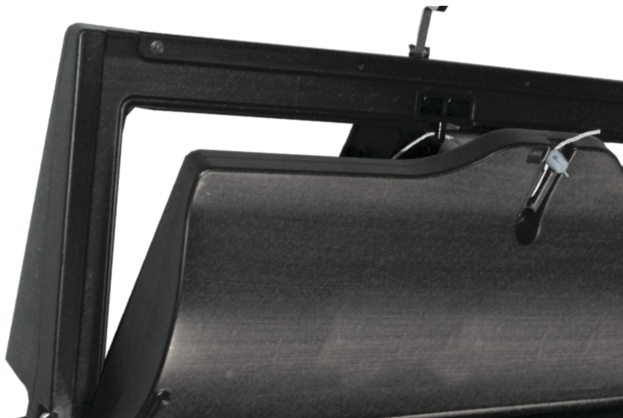
Aerodynamic frame and door design.