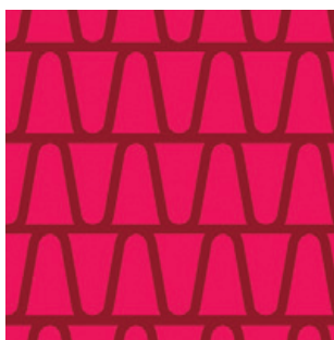
Patented HoneyCombe® wheel design provides a vast surface area for desiccant.

By optimizing the rotor design and reactivation circuit, Munters has improved the energy efficiency by 10-15% over standard desiccant dehumidifier systems.